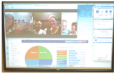
Photos: "Group Interactive Sessions" and "Personal Development Sessions" with 28 workers overseas. This is part of the preparation our time in Turkey.